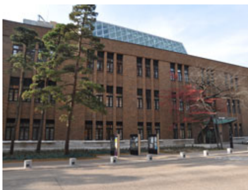
WPI-AIMR Main Building

The main building was completed with only four months' delay in spite of the Great East Japan Earthquake. This enables almost all researchers of AIMR to work together at the Katahira campus and it is expected to further the fusion research across different fields at AIMR more than ever.